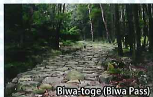
Biwa-toge (Biwa Pass)

Service provided even if there is only a single passenger