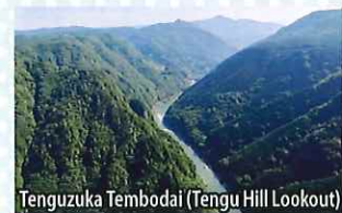
Tenguzuka Tembodai (Tengu Hill Lookout)