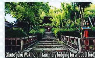
Okute-juku Wakihojin (auxiliary lodging for a feudal lord)