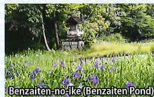
Benzaiten-no-ike (Benzaiten Pond)