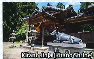
Kitano Jinja (Kitano Shrine)