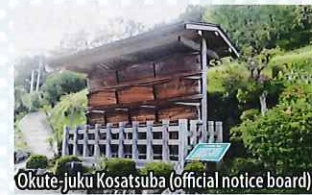
Okute-juku Kosatsuba (official notice board)