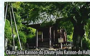
Okute-juku Kannon-do (Okute-juku Kannon-do Hall)