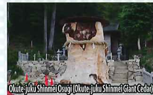
Okute-juku Shinmei Osugi (Okute-juku Shinmei Giant Cedar)