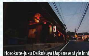
Hosokute-juku Daikokuya (Japanese style Inn)