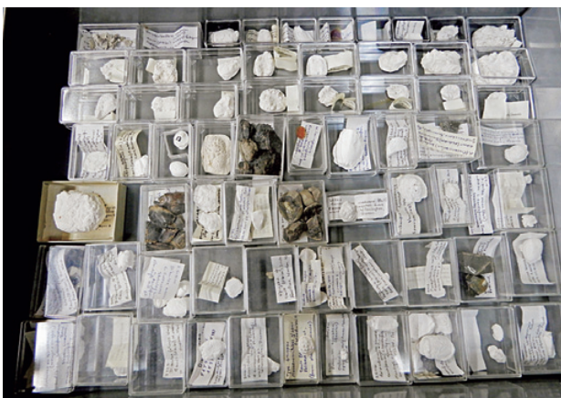
Fig. 1. Some of decapod specimens were sent by Mr Collins. 図 1. コリンズ氏から寄与された標本の一部。

Mr Joe S. H. Collins (London), a senior researcher of palaeontology died at January, 2019. He had submitted many excellent papers to the Bulletin of the Mizunami Fossil Museum (BMFM) since 1994. The paper published in this volume is his last one of papers. The Mizunami Fossil Museum has about 30,000 specimens of decapods. Among these there are about 500 specimens, kindly sent by Joe (Fig. 1). These contain many casts of type and figured specimens of the world. His collection is very useful to us and museum visitors. The generic name of Collinsius simplex and the specific name of Ozius collinsi was dedicated to Mr Collins and both types have been deposited in the Mizunami Fossil Museum (Fig. 2).